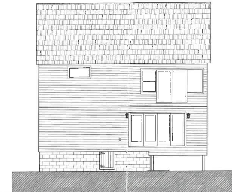
1 EXISTING CONDITIONS SCALE: 1/4"=1'-0"