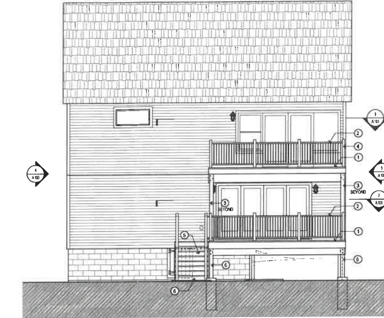
2 PROPOSED DECK - WEST ELEVATION SCALE: 1/4"=1'-0"