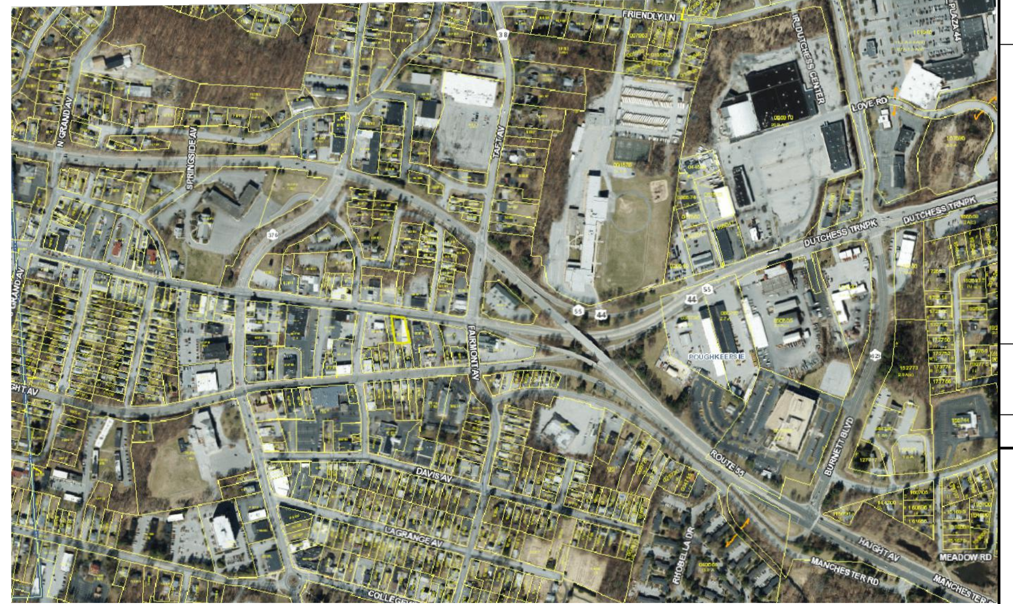
VICINITY MAP 1" = 400'±

PARCEL INFORMATION TAKEN FROM DUTCHESS COUNTY TAX MAP, 2005