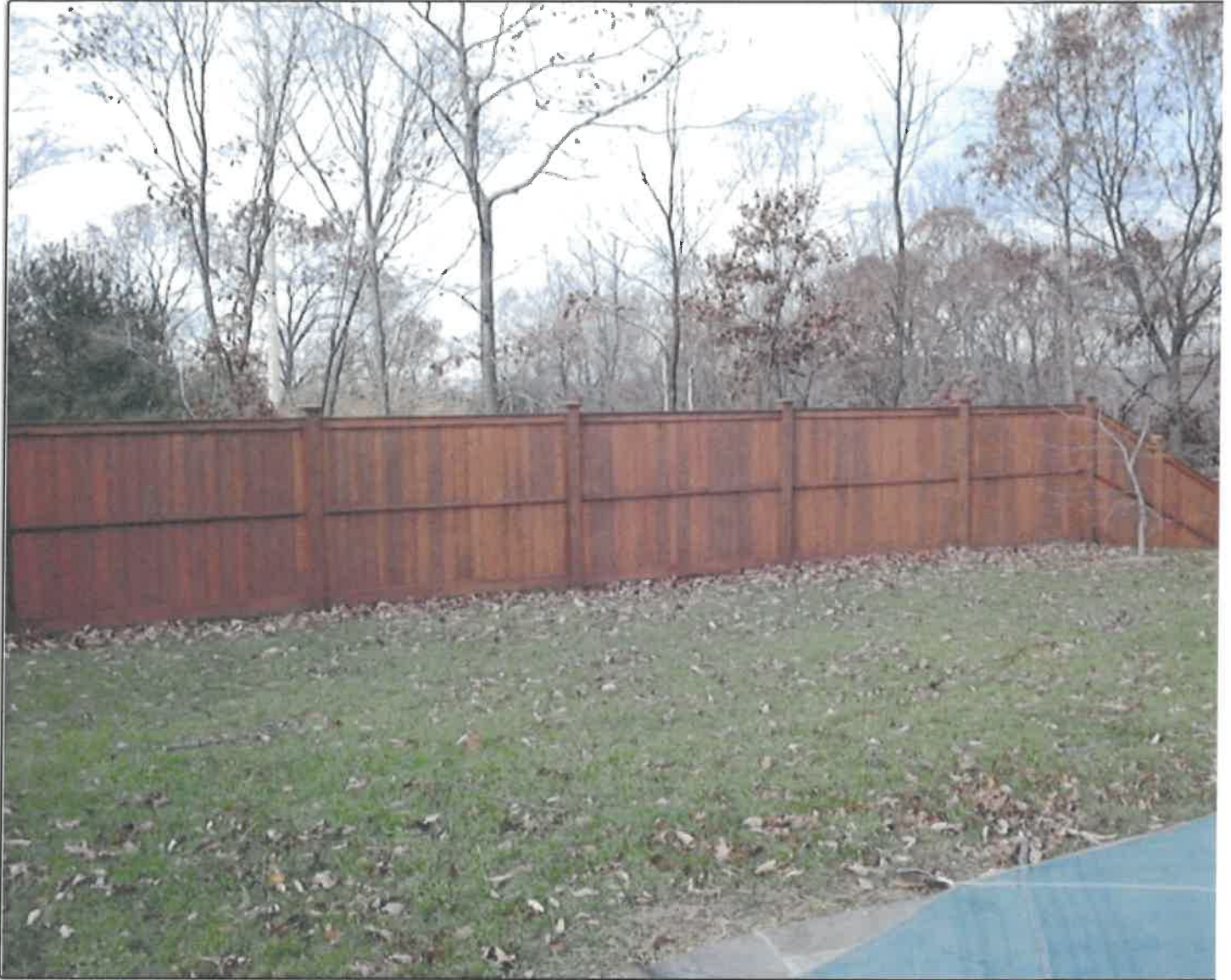
Cedar Tongue & groove